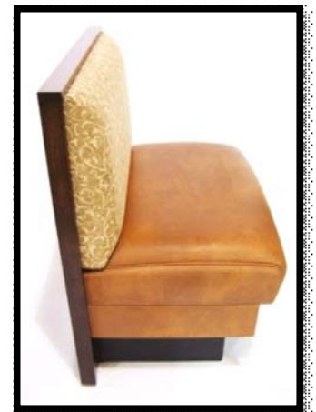
PHOTO OF D&D SERIES 100 BOOTH WITH OPTIONAL WOOD TRIM